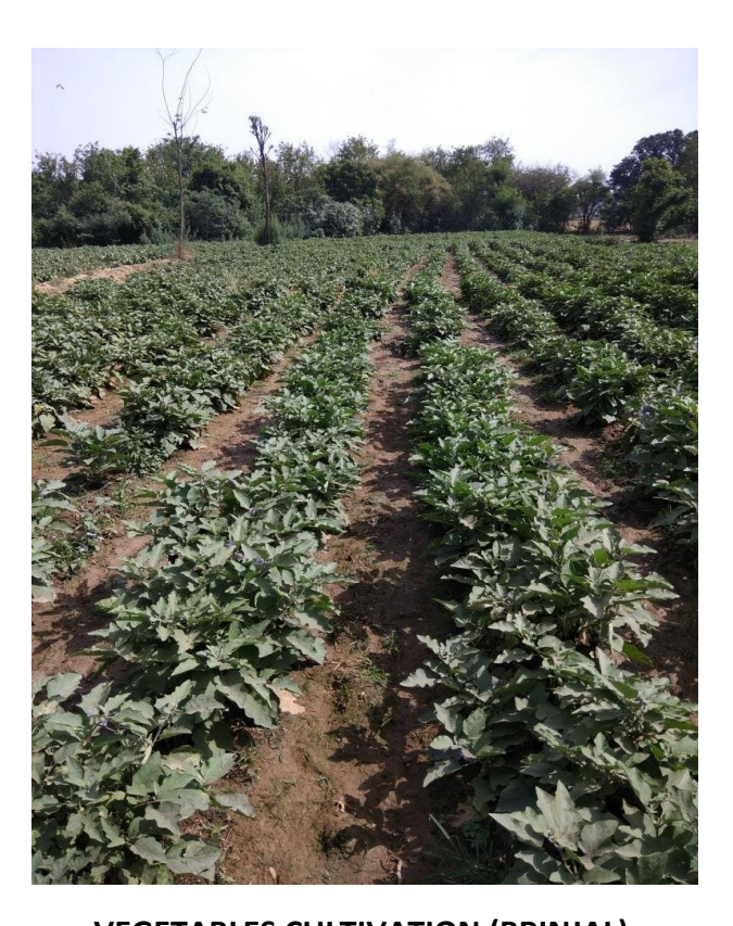
VEGETABLES CULTIVATION (BRINJAL)