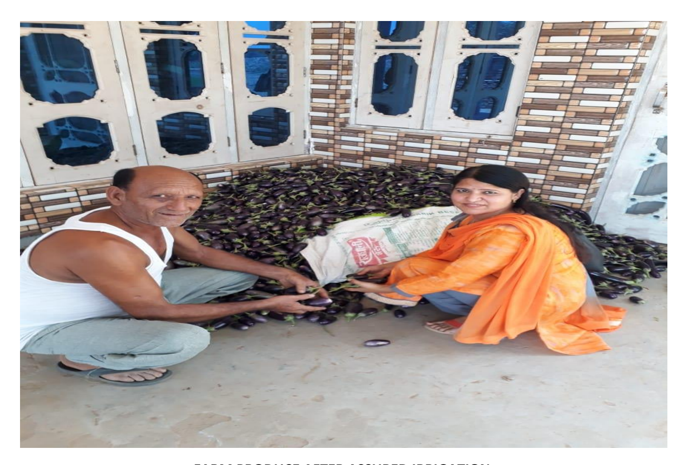
FARM PRODUCE AFTER ASSURED IRRIGATION