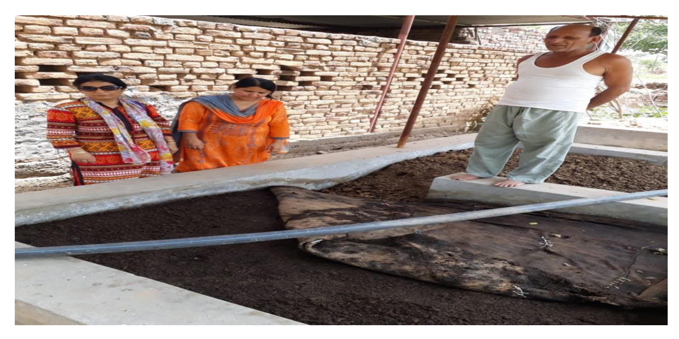
VERMICOMPOST UNIT IN OPERATION

PHOTOGRAPHS DEPICTING INVOLVEMENT OF FARMERS IN MULTIPLE AGRICULTURAL ACTIVITIES