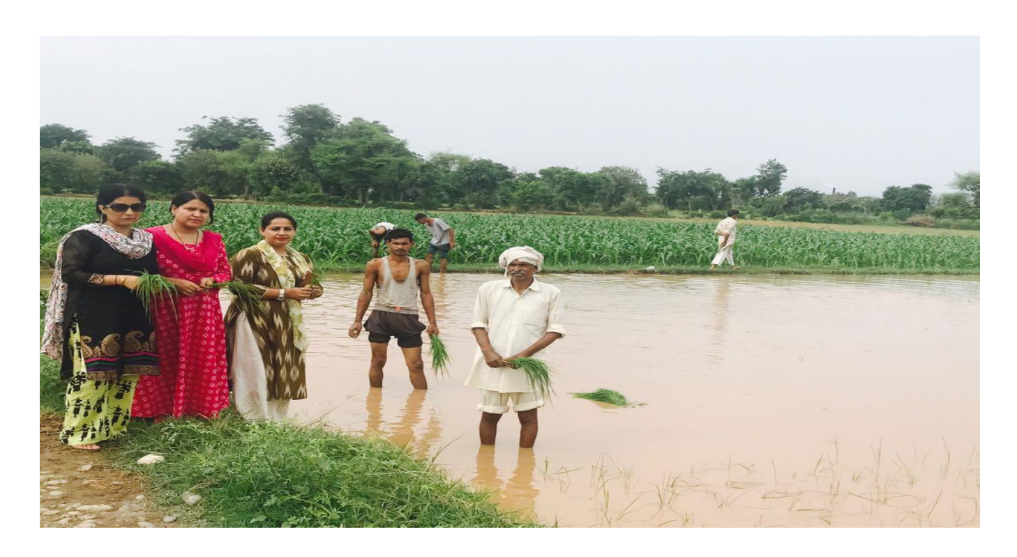
PHOTOGRAPHS DEPICTING INVOLVEMENT OF FAMILY MEMBERS IN MULTIPLE AGRICULTURAL ACTIVITIES